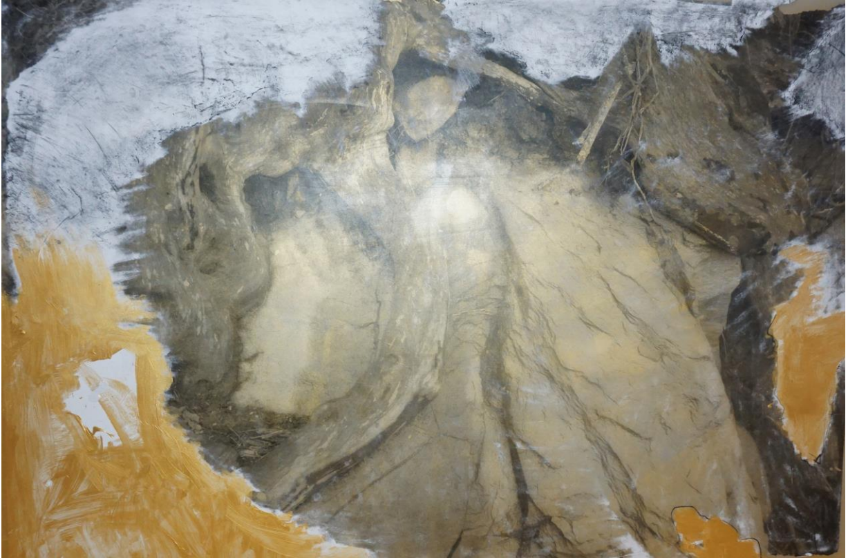
nature spirit, transfer technic, photo & acrylic on glass, 1 x 1.5 m, South Africa, 2016