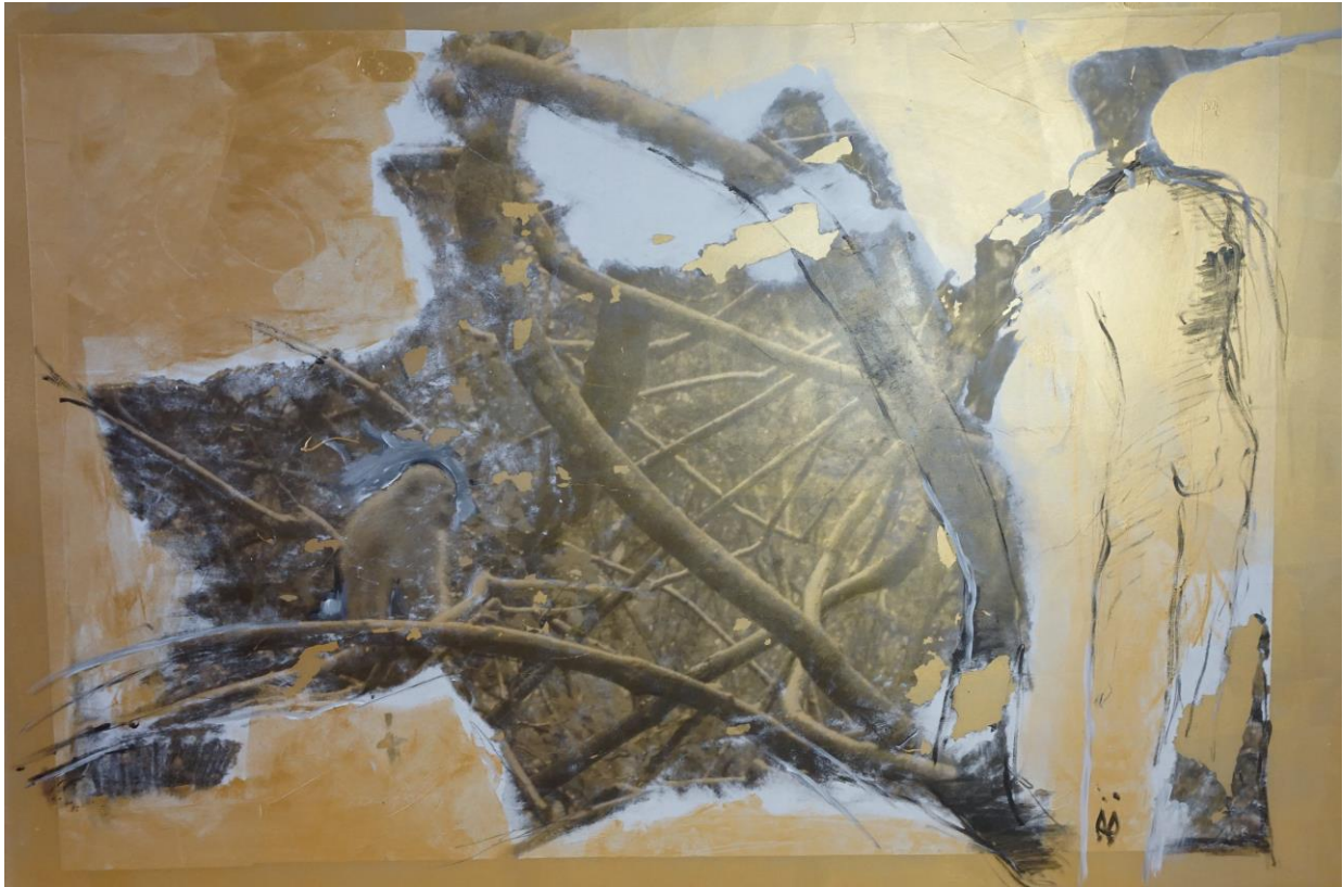
web of creation, transfer technic, photo & acrylic on glass, South Africa, 2016