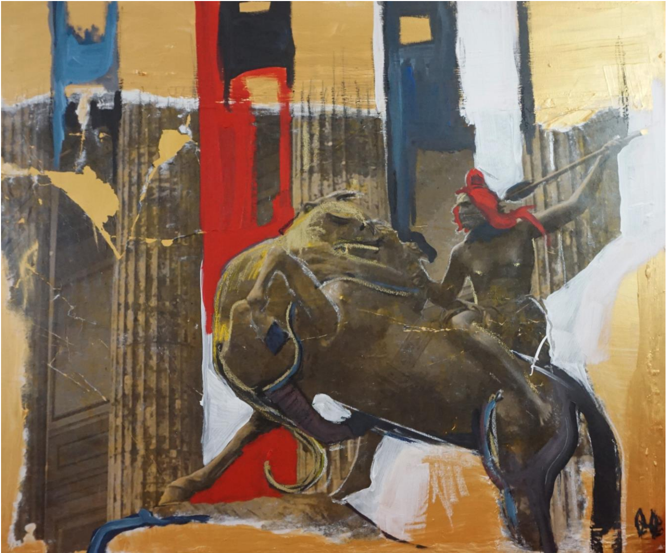
Amazon, Horse & Tiger, transfer technic, photo & acrylic on canvas, 1 x 1.2 m, Berlin 2017