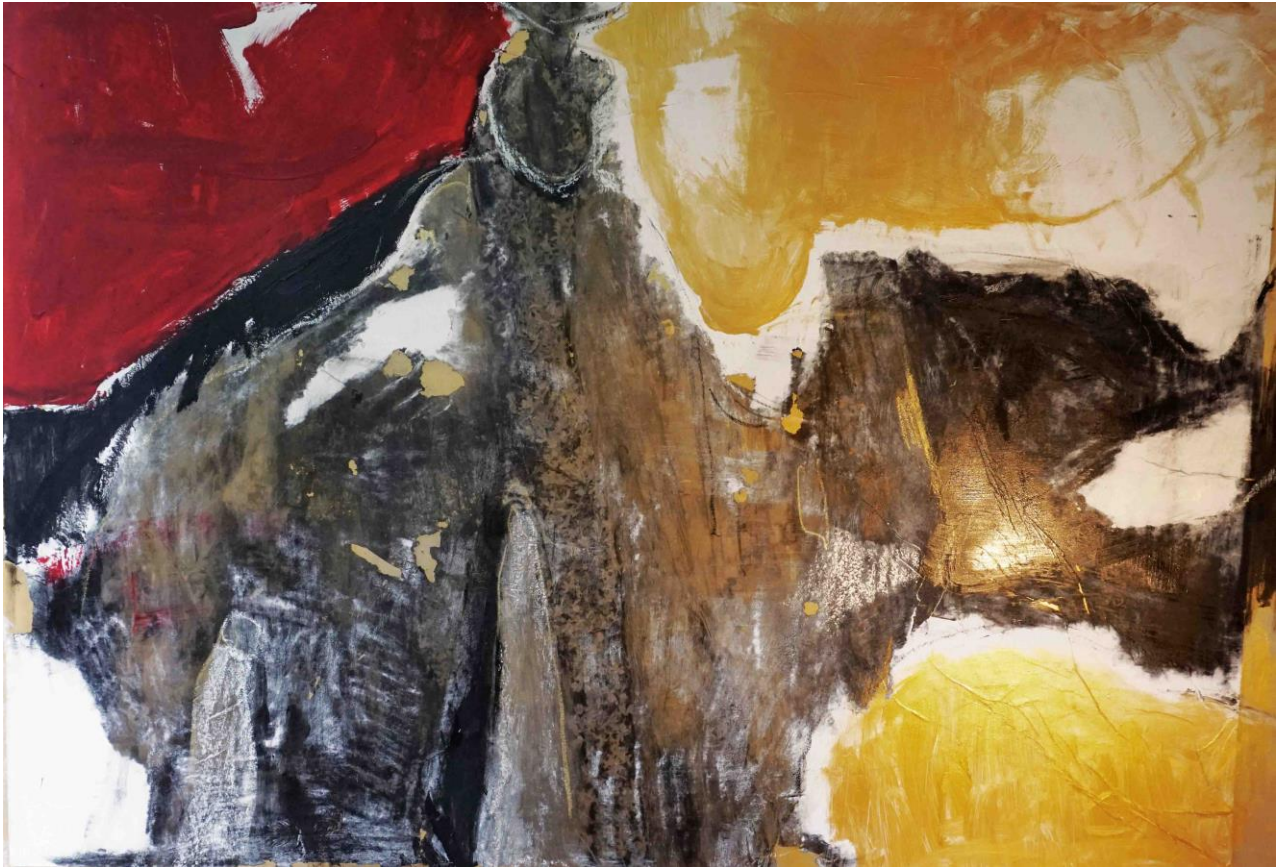
mother earth, transfer technic, photo & acrylic on glass, 1 x 1.5 m, South Africa, 2016