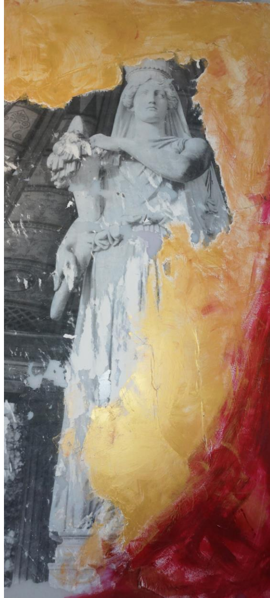
Goddess, transfer technic, photo & acrylic on glass, 1 x 2 m, Potsdam, 2012