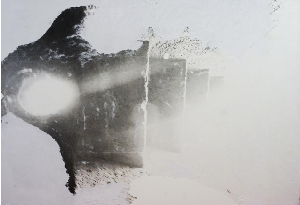
dimensions of time & space, transfer technic, photo & acrylic on canvas, 0.7 x 1 m, Sardinia, 2017