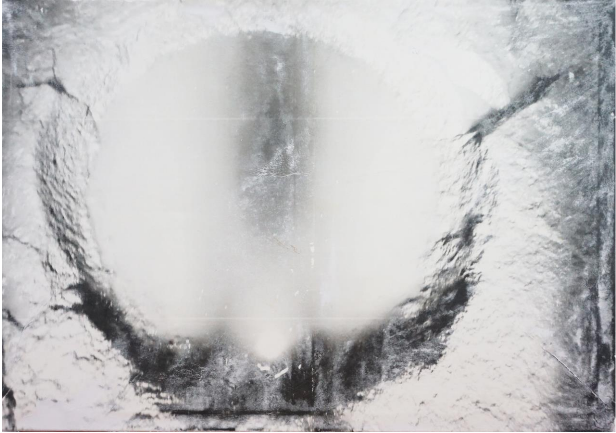
dimensions of time and space 2, transfer technic, photo & acrylic on canvas, 0.7 x 1 m, Sardinia, 2017