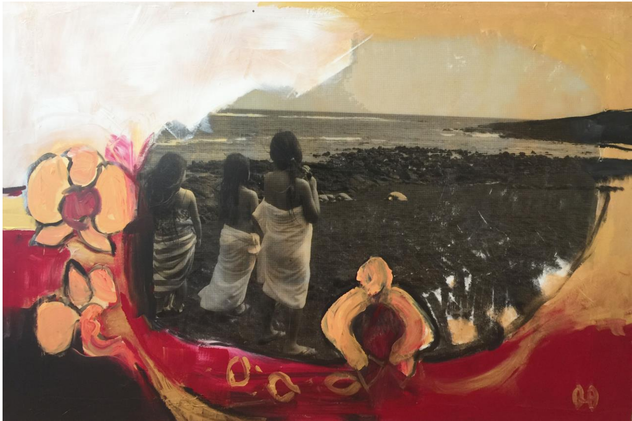
Hawaiian future, transfer technic, photo & acrylic on glass, 1 x 1.5 m, Hawaii, 2016