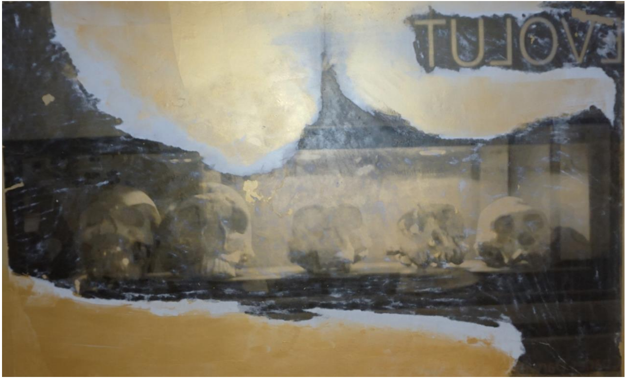
cradle of humankind, transfer technic, photo & acrylic on glass, 1 x 1.5 m, South Africa, 2016