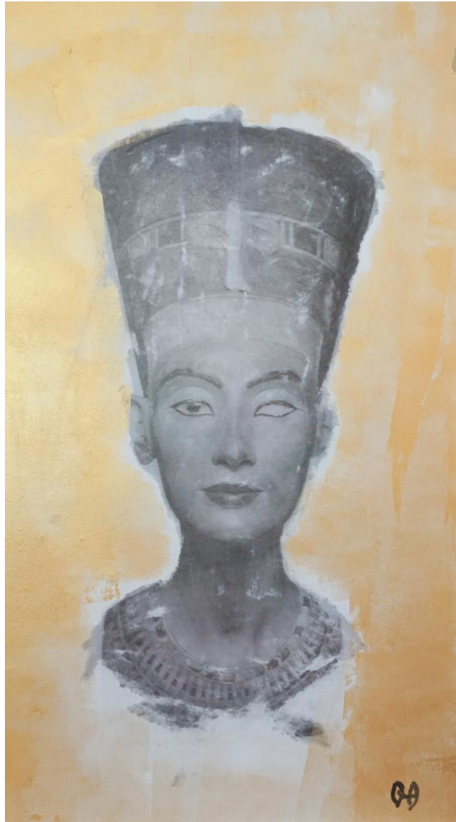
Nofretete, transfer technic, photo & acrylic on glass, 0.5 x 0.85 m, Berlin, 2016