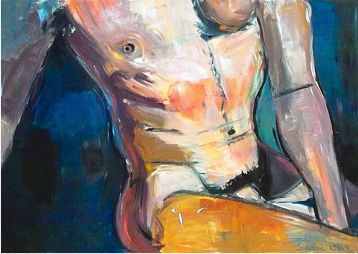
man in perspective, 1.5 x 2.1 m, acrylic on canvas, 2002